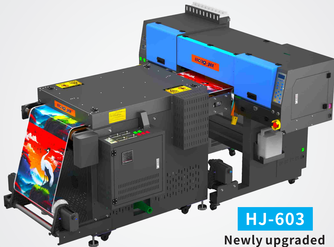
HJ-603 Newly upgraded